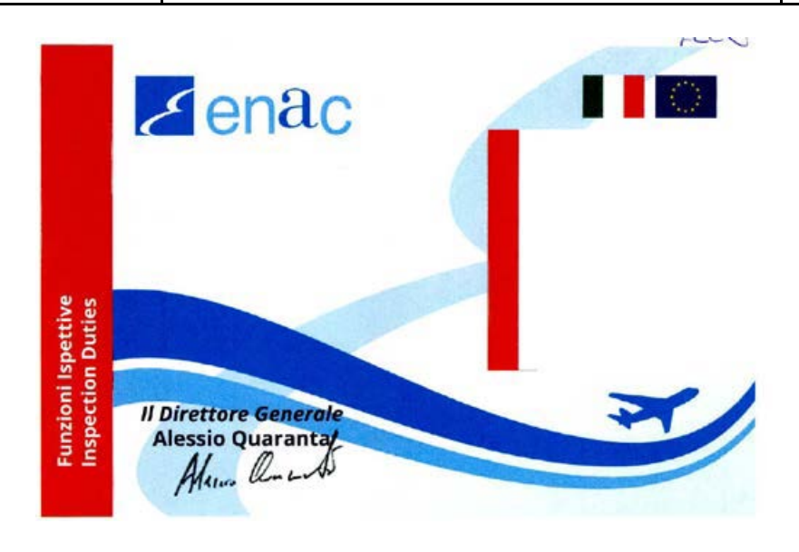
Layout of Multiservice ID card with red side stripe and the note "Inspection Functions – Inspection Duties"

Multi-service id card with tricolor band and note "Exempt - Free" issued to the heads of ENAC, and specifically, the President, the General Director and the Central Director who coordinates the local offices, as well as to the head of the airport sector of the Presidency of the Council of Ministers Information Service for Security of the Republic.