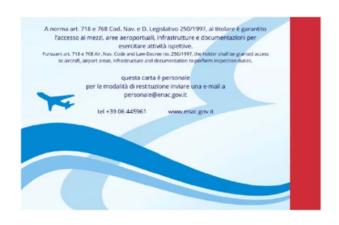
Layout of multi-service card with tricolor band and note "Exempt – Free"